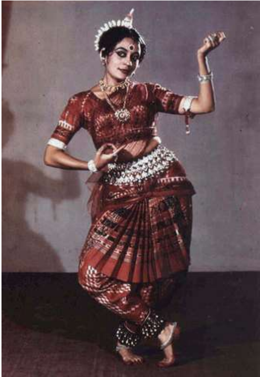
2.1.12 Guru Smt. Sonal Mansingh