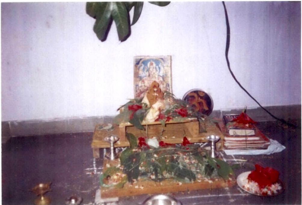
4.34. Lord Ganesha with Bengal gram flour, turmeric, tooth picks, etc. by Balamani