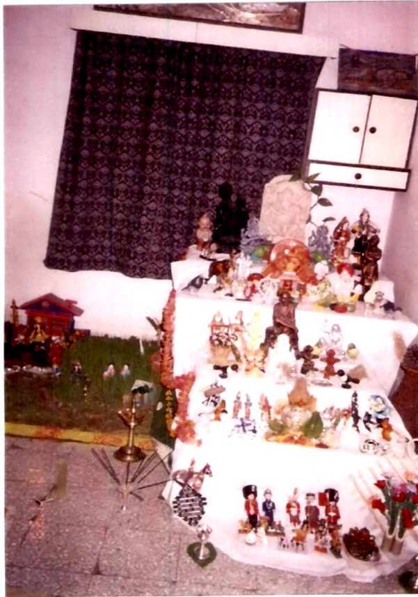
4.29.Arranging Koluvu is an aesthetic activity