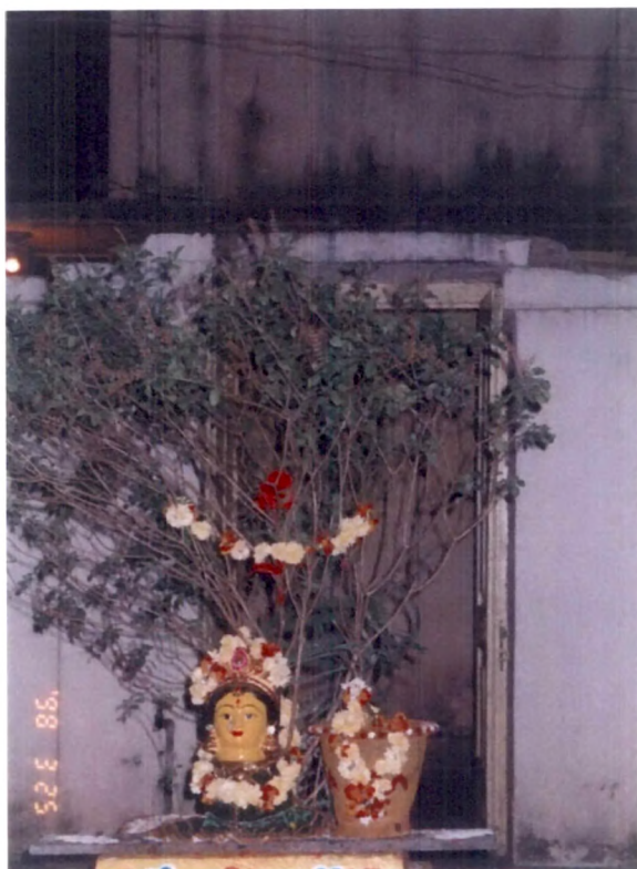
4.18.Goddess Tulasi decorated for worship