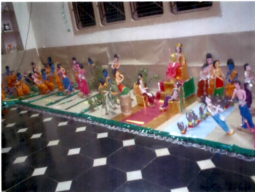
4.24. Ravana's court, lord Hanuman sitting on his tail.