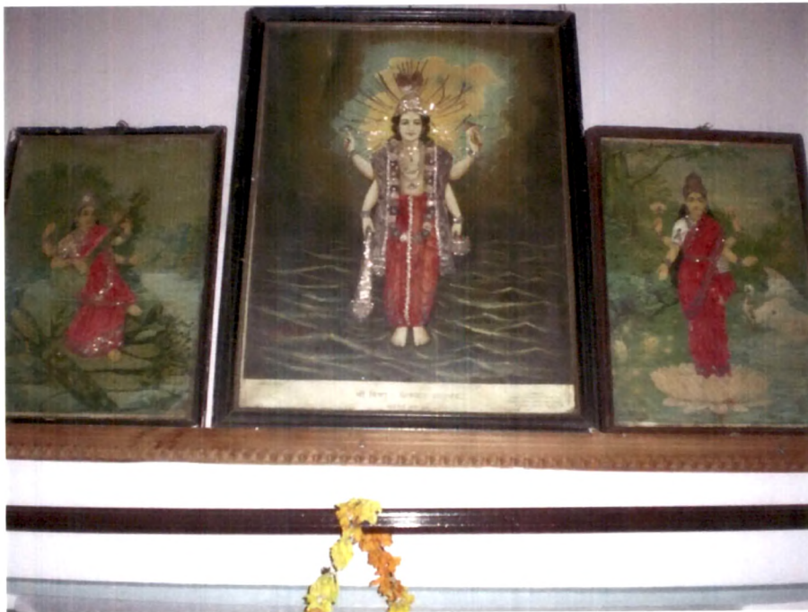
4.16. Oleographs are stitched with silk costumes and decorated with ornaments in 1920's by J. Sundaramma