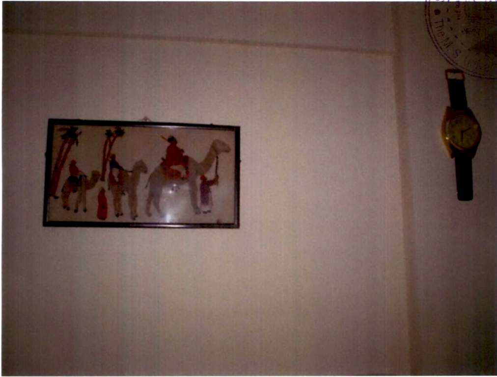
4.7.A frame stitched by Smt.Janaki