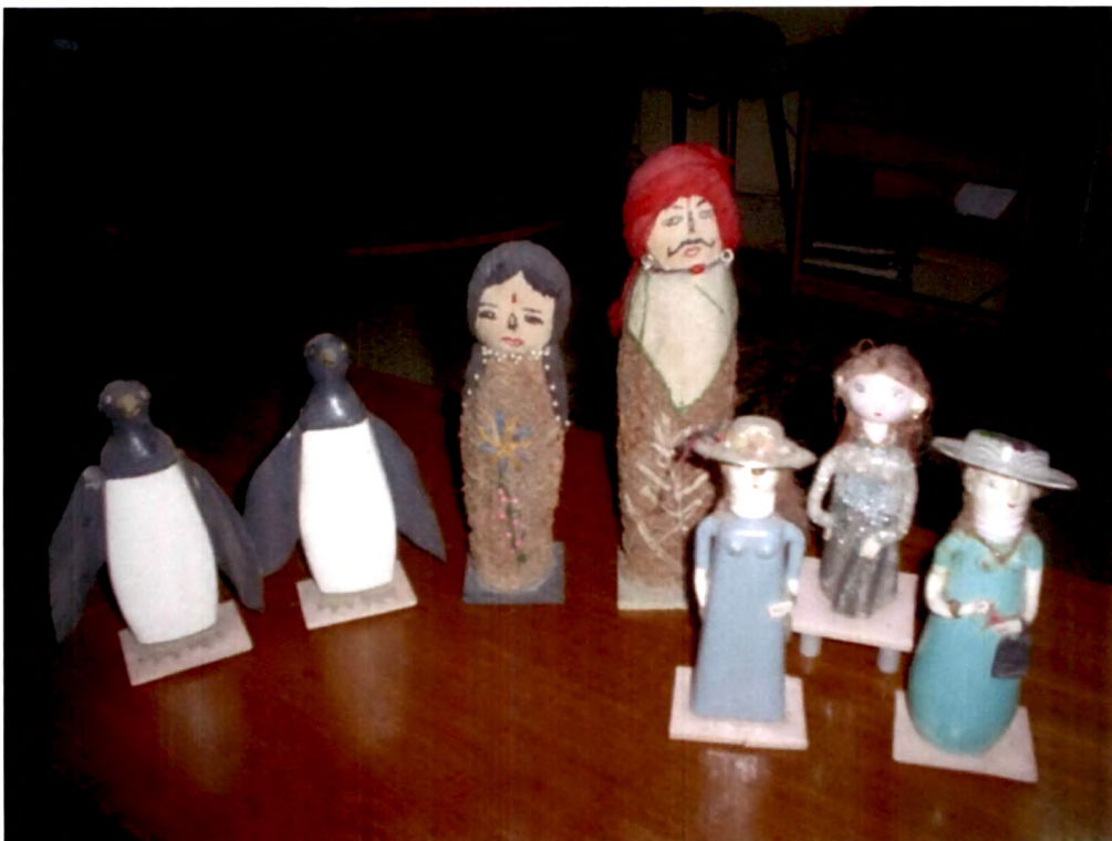
4.6. Smt. Janaki made toys out of dried vegetables