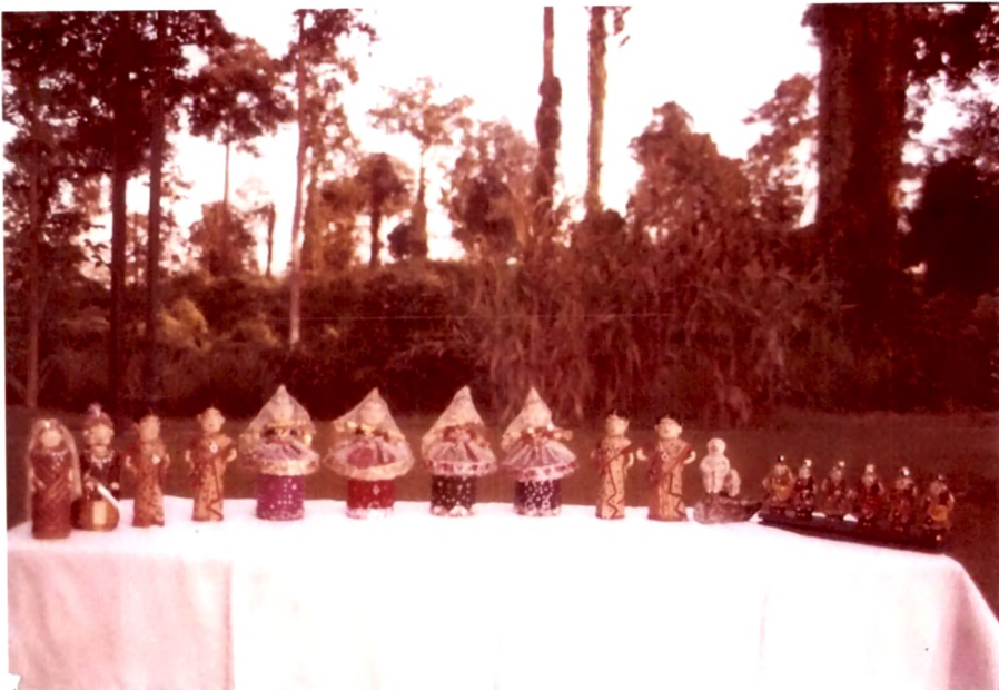
4.4.Smt.Janaki made toys out of waste materials