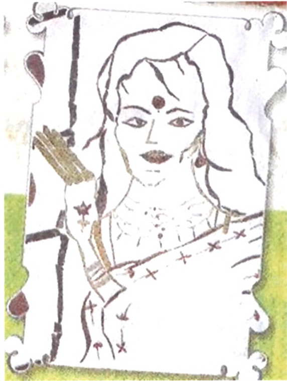
4.28.Smt. Laxmi Suhasini's herbal collage