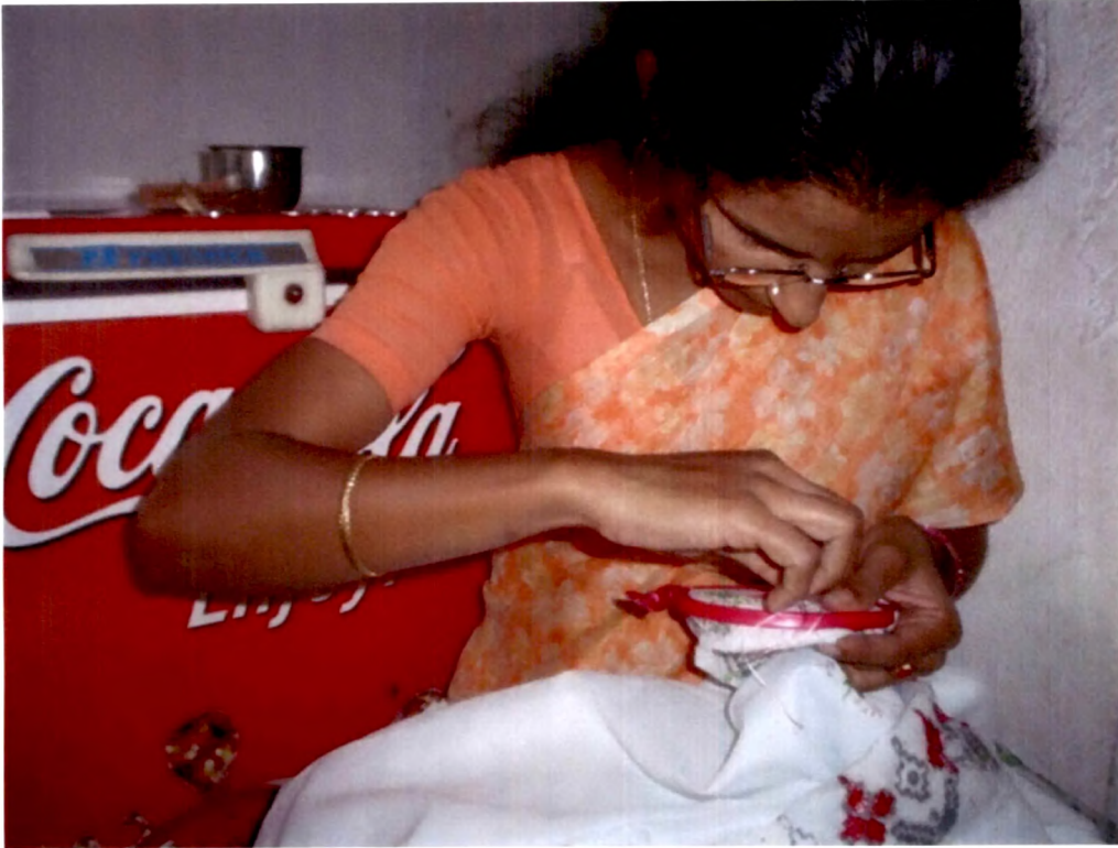
4.35.Embroidery sticthing is a great pass time activity