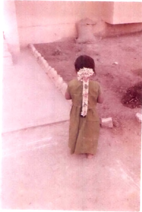
4.15. Flower stitching on a plaited hair-a pass time activity of summer vacation