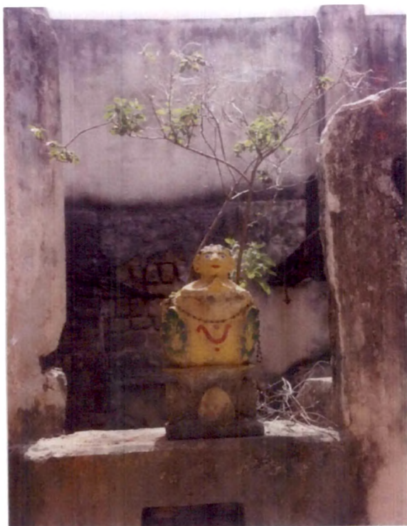
4.17.J.Sundaramma made Tulasi pot with cement in 1930's