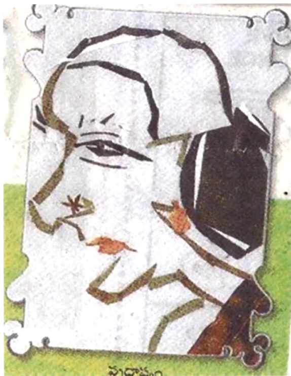
4.26.An amatuer artist Laxmi Suhasini-herbal collage work