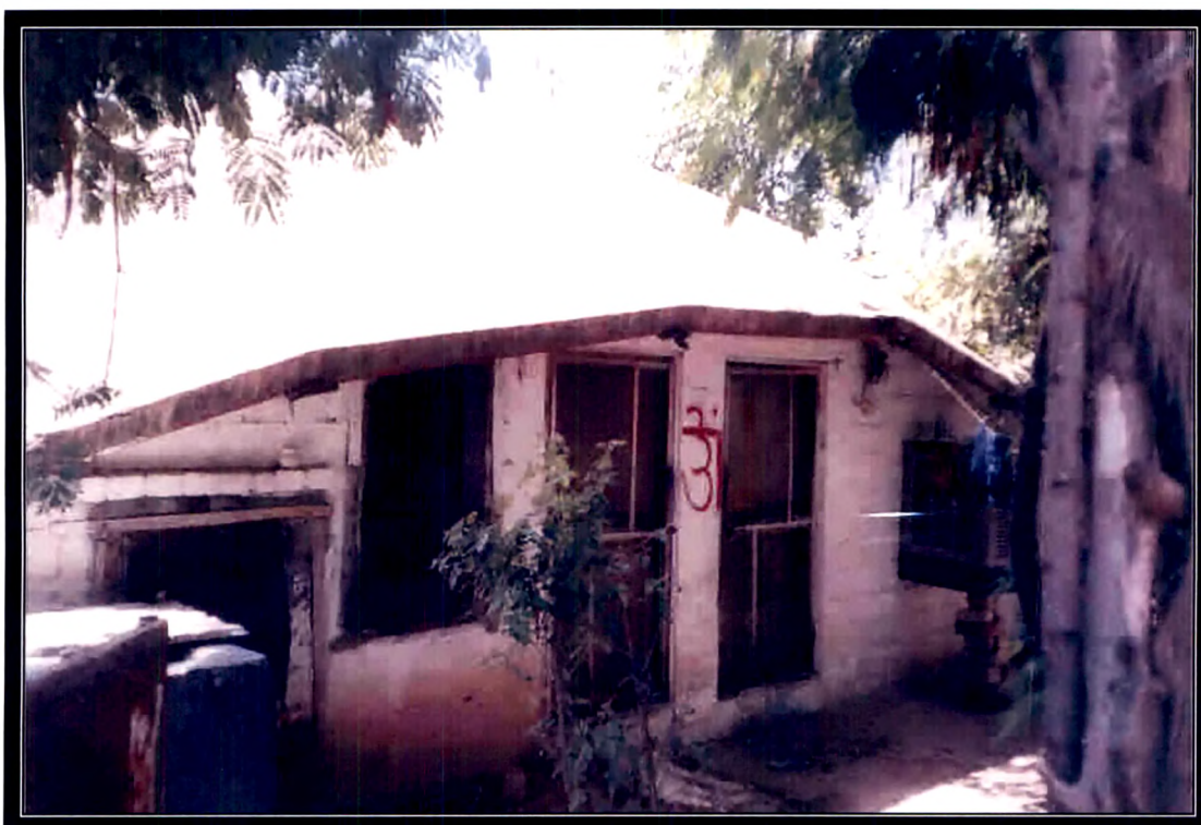
ONE ROOM TENEMENTS SETS