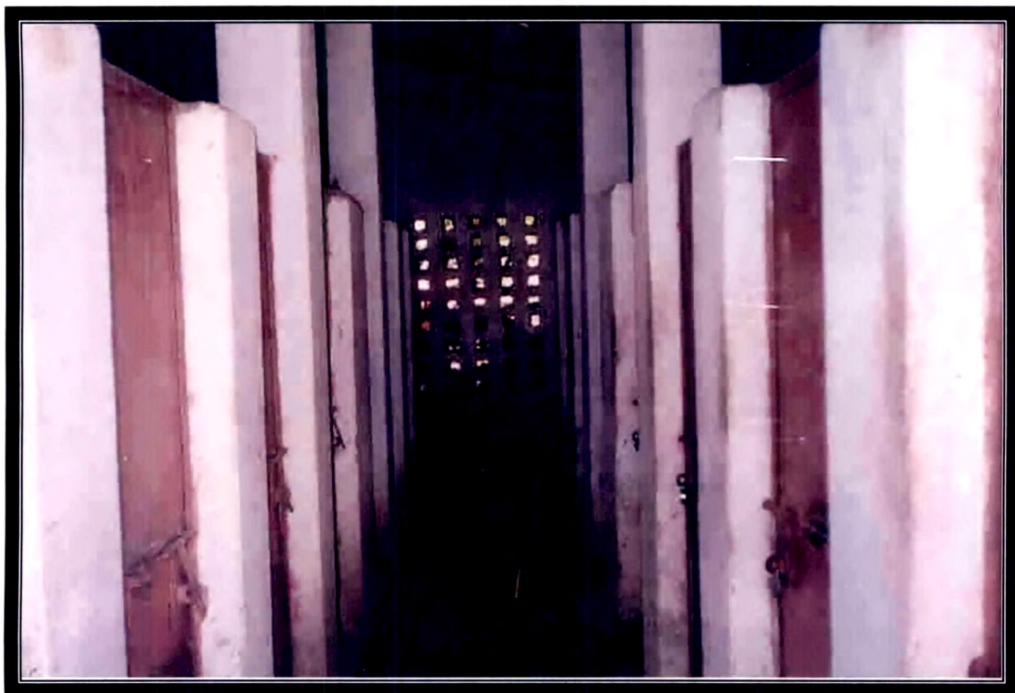
COMMUNITY SANITATION FACILITIES AT CAMPS FOR DISPLACED KASHMIRIS