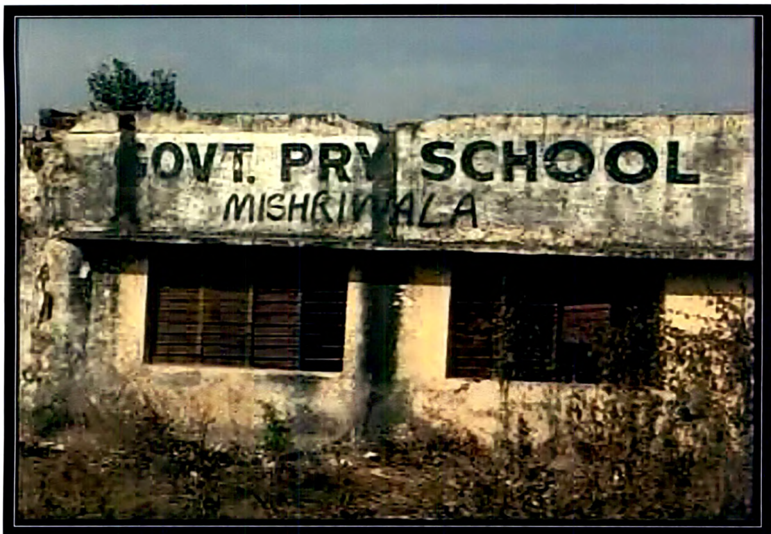
CAMP SCHOOLS FOR DISPLACED KASHMIRI STUDENTS