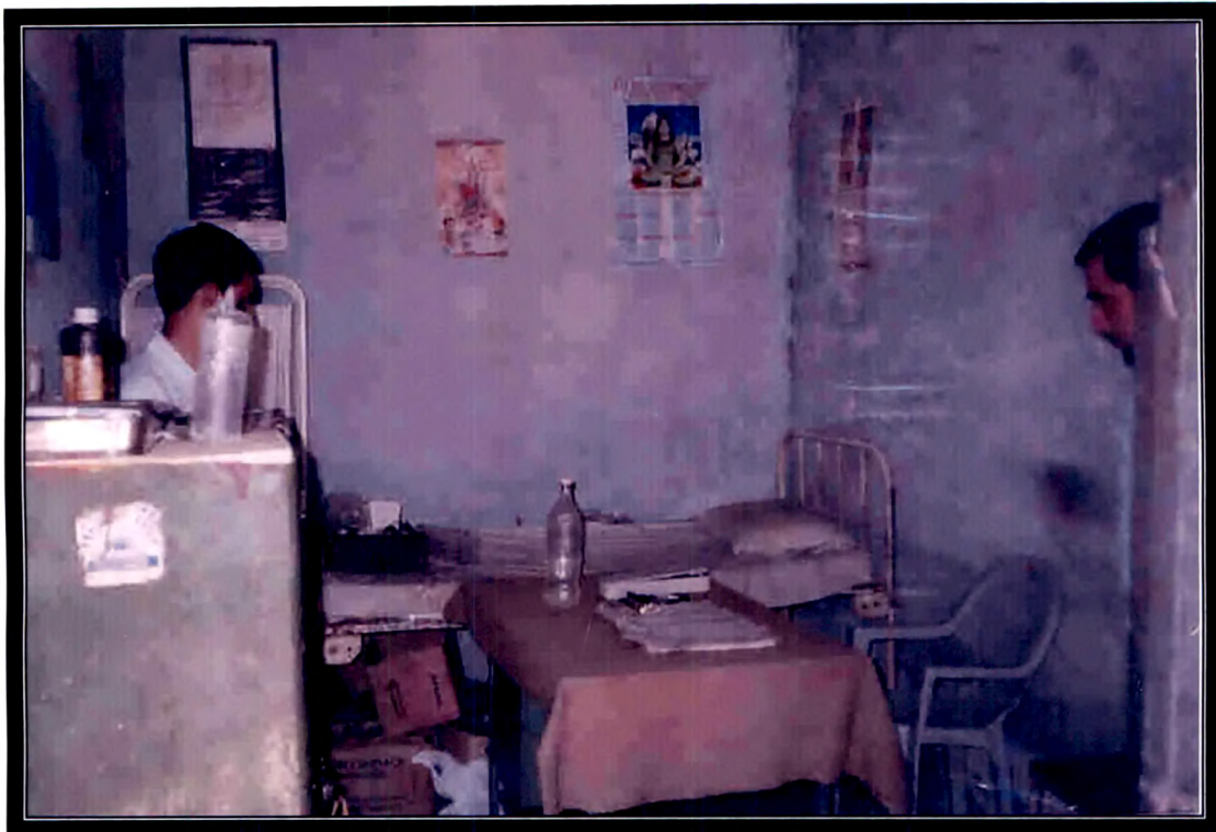
HEALTH CENTER AT CAMP FOR DISPLACED KASHMIRIS