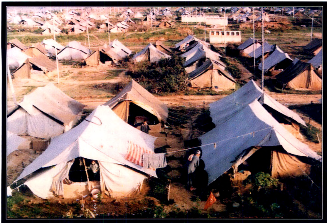
TENTS PROVIDED BY GOVERNMENT BEFORE PROVIDING ONE ROOM TENEMENT SETS