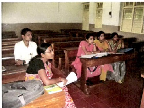
Group work during Lesson Designing