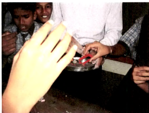
Students performing the Experiment