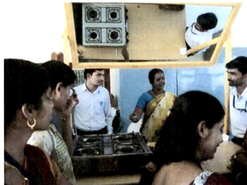
Demonstrations at Home Science Department