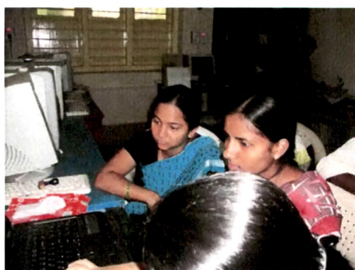
Pre-Service Teachers' involvement in Group Activities