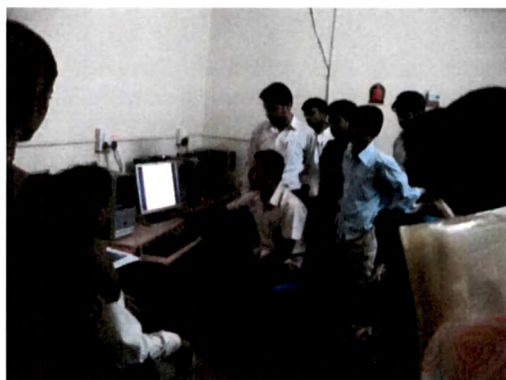
GroupWise Power Point Presentations on the Lessons