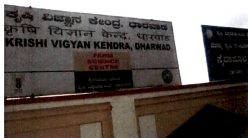
Visit to a Agricultural Science Centre, Dharwad