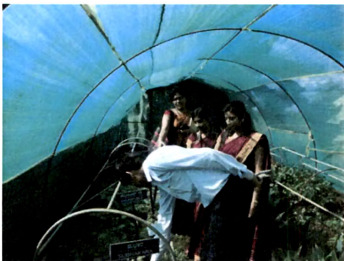
Visit to Green-house