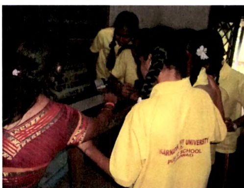
Pre-Service Teacher's & Students involvement in discussion