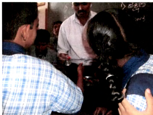
Students involved in Experiments with Pre-Service Teacher