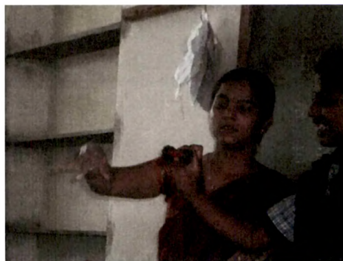
Demonstration of the Experiment by Student