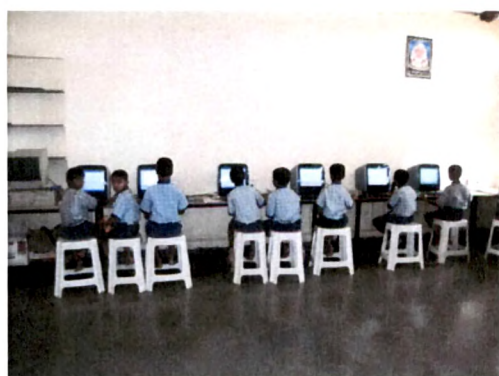
Students browsing the internet