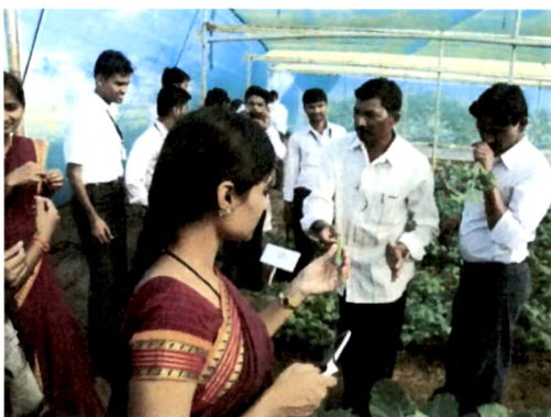
Interactions with Faculty of Horticulture Dept.