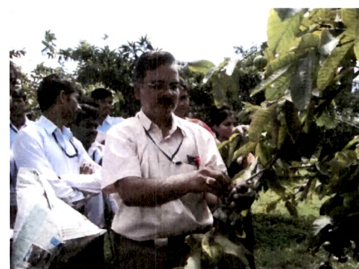
Demonstration of Plant Breeding to Pre-Service Teachers