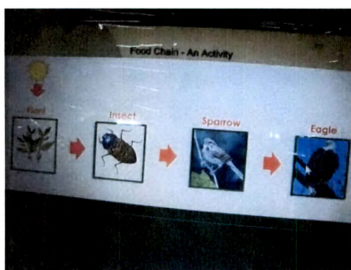
Online activity on Food Chain