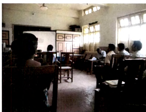
Practicing the Lessons employed ICTACLA