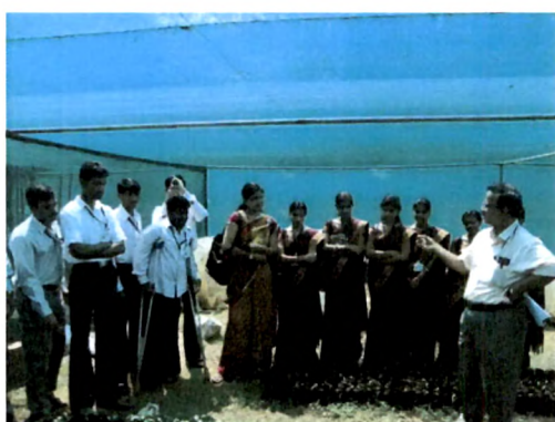
Discussion with Agricultural Scientist