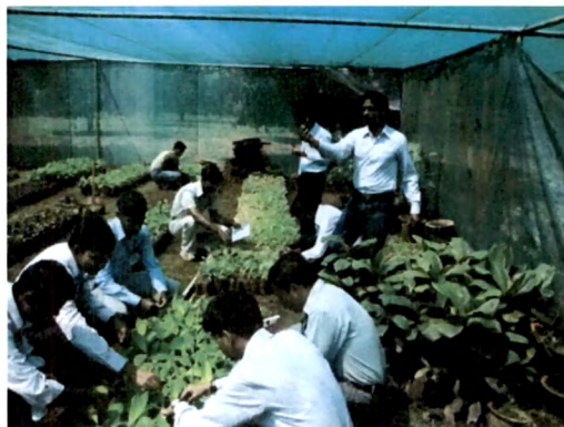
Pre-Service Teachers involvement Field Activity