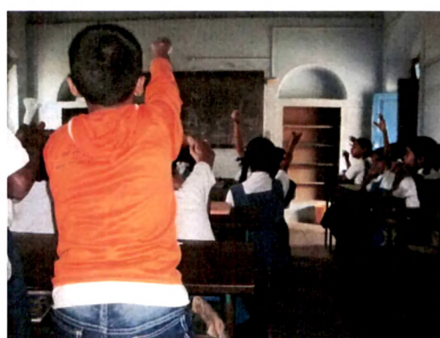
Students' interactions in the Class