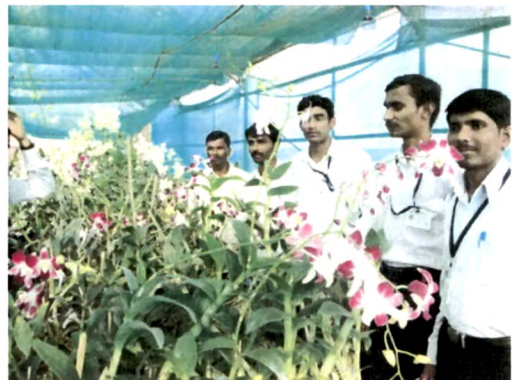
Visit to Green-house at Horticulture Dept, UAS, Dharwad