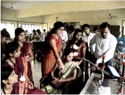
Observing latest Scientific Instruments in UAS, Dharwad