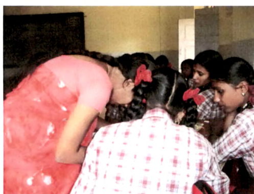
Pre-Service Teacher assessing the Group Activities