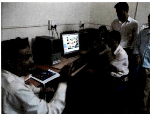
GroupWise Power Point Presentations on the Lessons