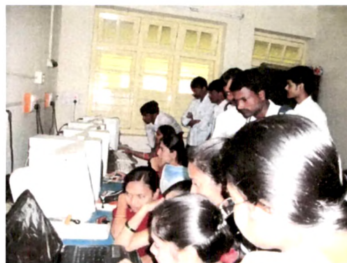
Preparation for the Lesson Designs employing ICTACLA