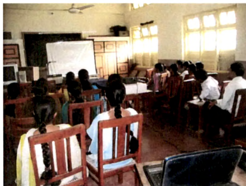
Involvement of Pre-Service Teachers watching Educational Videos