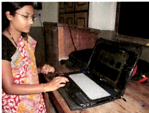
Practicing activity on Food Chain