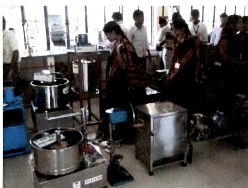
Visit to Home Science Department, University of Agricultural Sciences, Dharwad