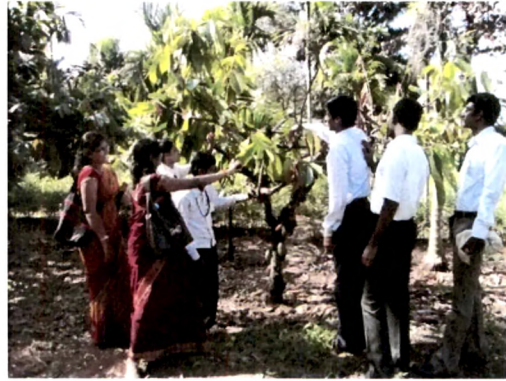
Pre-Service Teachers' discussion