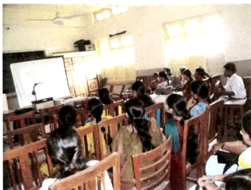
Presentation of Educational Videos