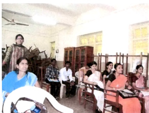
Practicing the Lessons employed ICTACLA