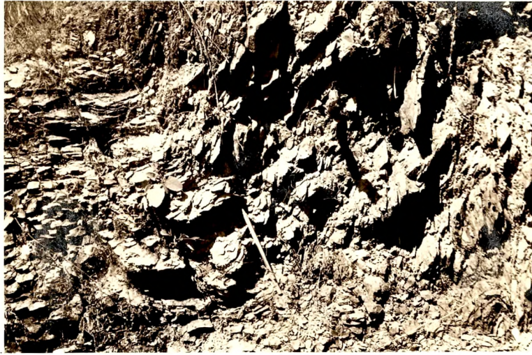
Field photograph of foliated and jointed traps (Loc. Near Ghorakhal).