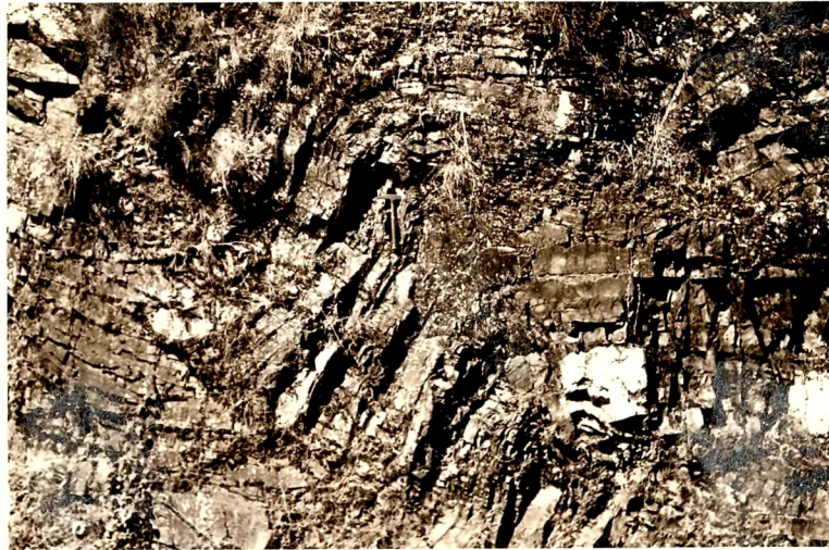
Field photograph of a fold ( F_1 ) in quartzite-slate. (Loc. West of Bhimtal 1 near Bohrakun, on the road to Kathgodam).