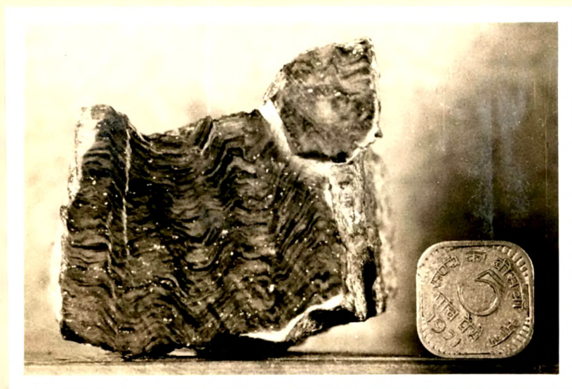
Photograph of a specimen of highly sheared and crumpled granophyre resembling a phyllite and showing strain-slip cleavage.