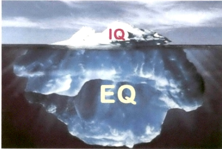
Figure 1.1: EQ – IQ Diagram

capable; and (c) during the next ten years, to raise at least ten percent of the institutions to an optimum standard.”