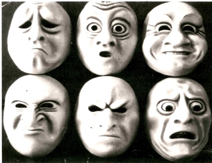
Figure 1.2: Various Emotions

Emotions serve as carrier waves for the entire spectrum of feelings. When our hearts are in a state of coherence, we more easily experience feelings such as love, care, appreciation, and kindness. On the other hand, feelings such as irritation, anger, hurt, and envy are more likely to occur when the head and heart are out of alignment. Our emotional experiences become imprinted in our brain cells and memory, where they form patterns that influence our behavior.