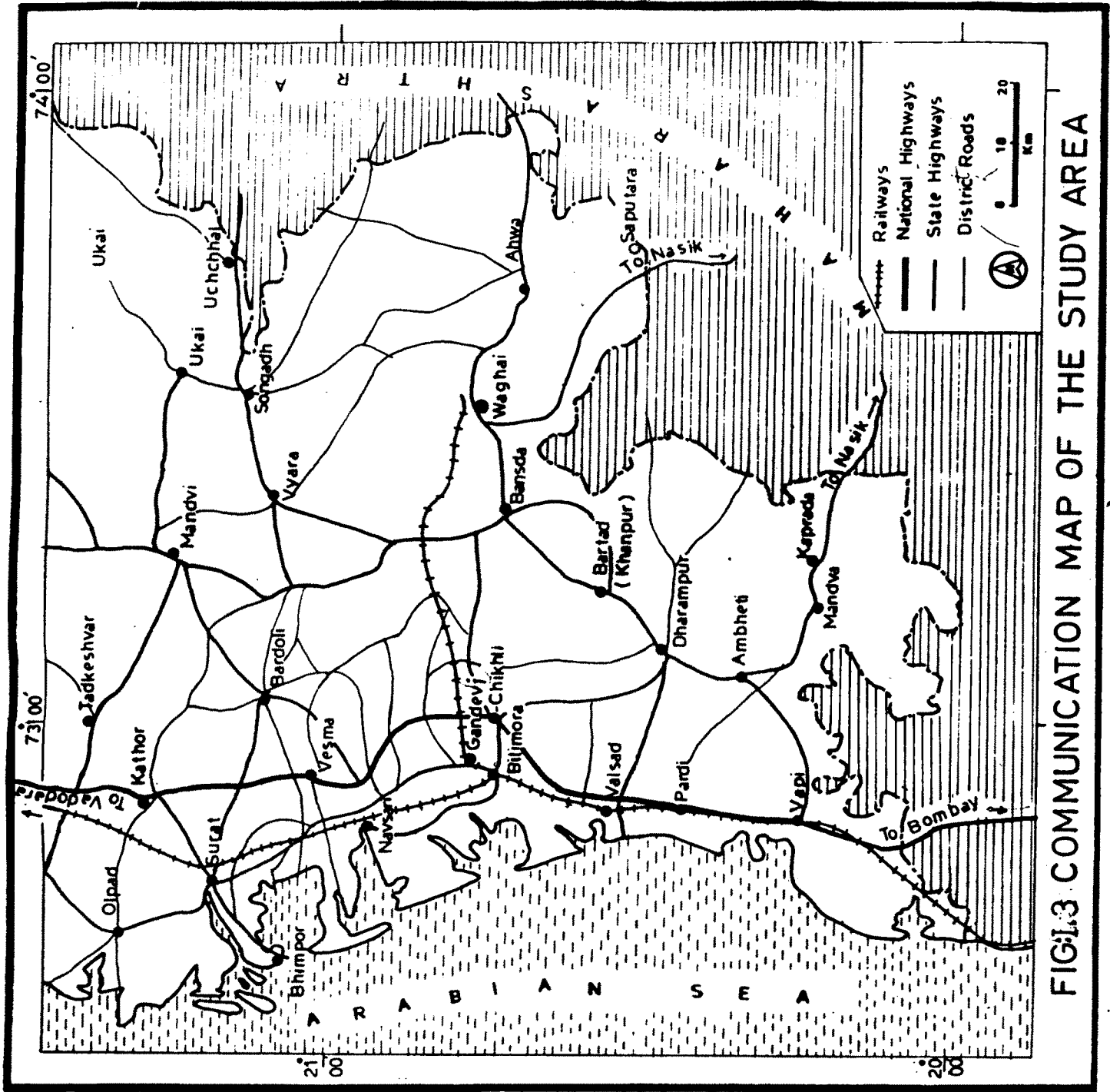
FIG:1.3 COMMUNICATION MAP OF THE STUDY AREA