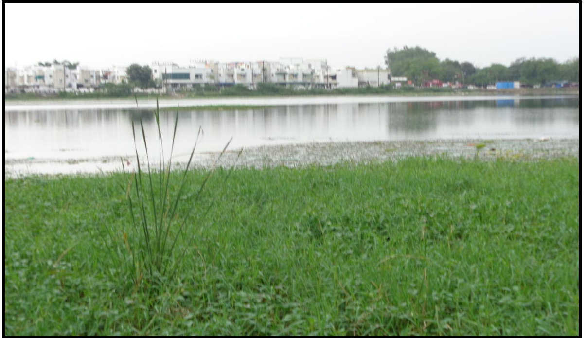
Figure : 4: Site 1: Harani Pond, Vadodara