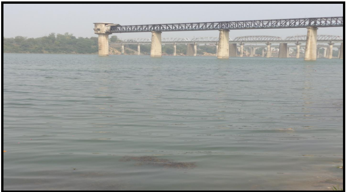
Figure 7: Site 4: Mahisagar River, Vadodara