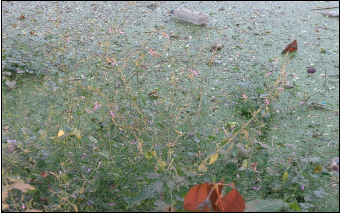
Figure 6 : Site 3: Sewasi Pond, Vadodara