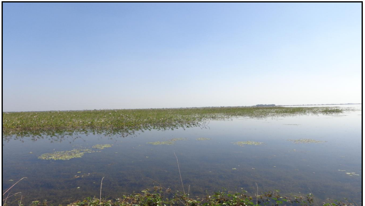
Figure 9 : Site 6: Vadhavana Village Pond, Vadodara