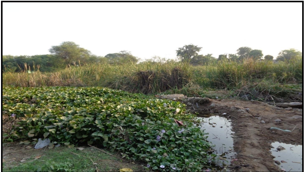
Figure 5: Site 2: Gotri Pond, Vadodara