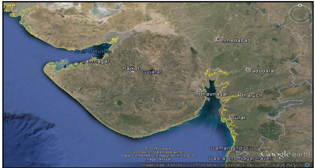
Figure 2: Map of Gujarat