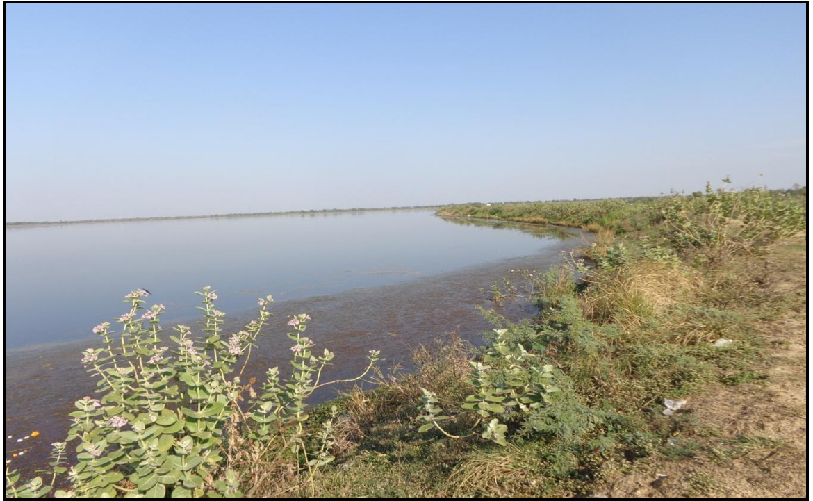
Figure 8 : Site 5: Timbi Village Pond, Vadodara