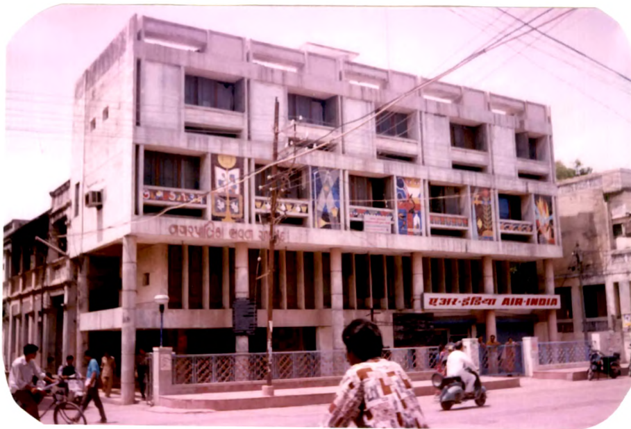
Plate 14. Office complex – Anand Municipality & Air India.