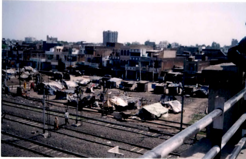
Plate A. Slums along railway line – View from the Over bridge.