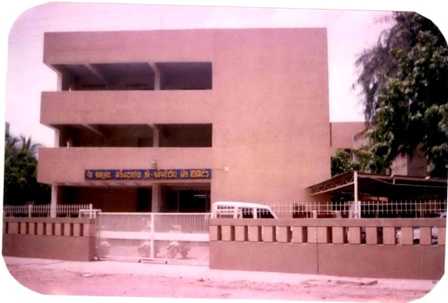
Plate 19. The Anand Mercantile Cooperative bank ltd.