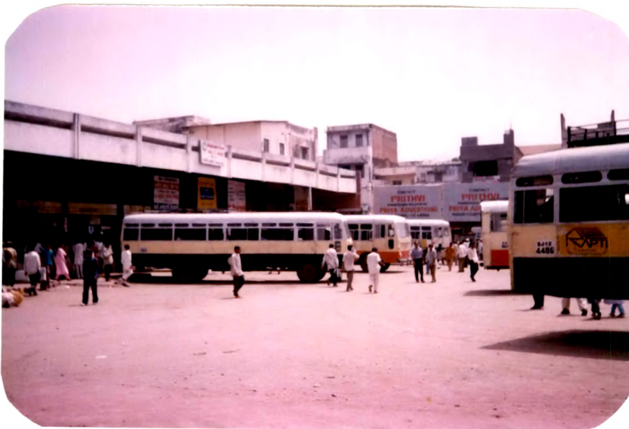
Plate 12. S.T. Depot.