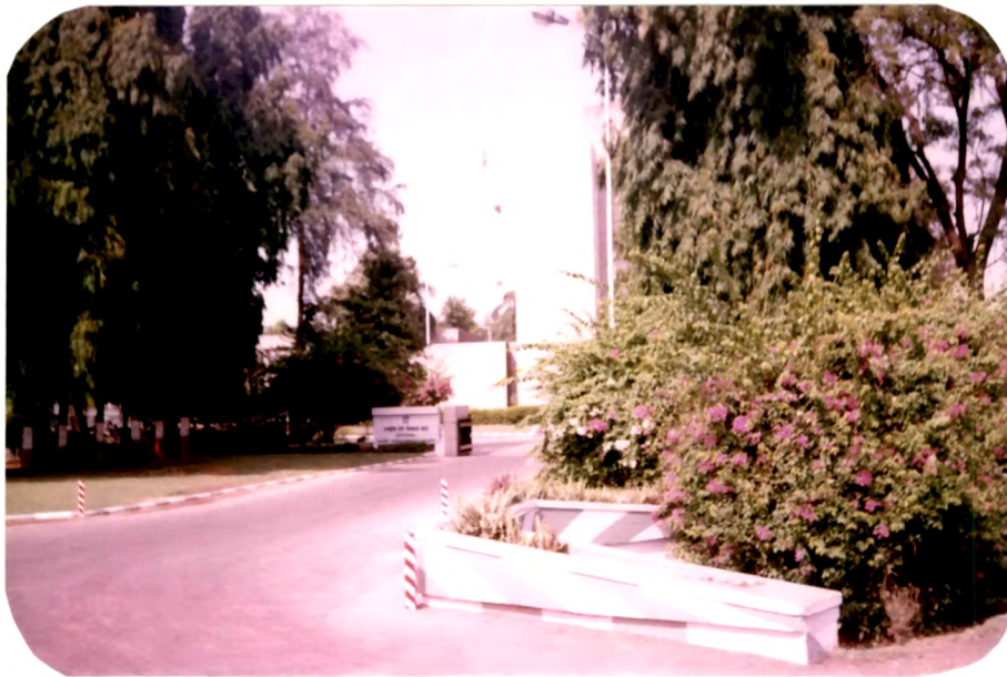
Plate 5. Entrance into NDDB ( National Dairy Development Board )