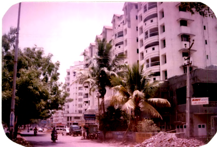
Plate 22. Multistoried buildings – Vallabh Vidyanagar road.