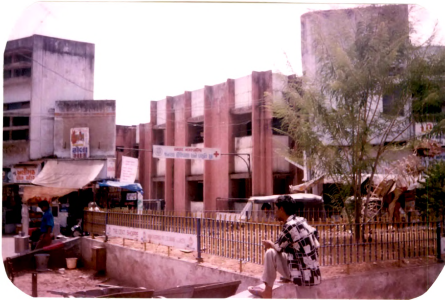
Plate 13. Municipal Hospital.