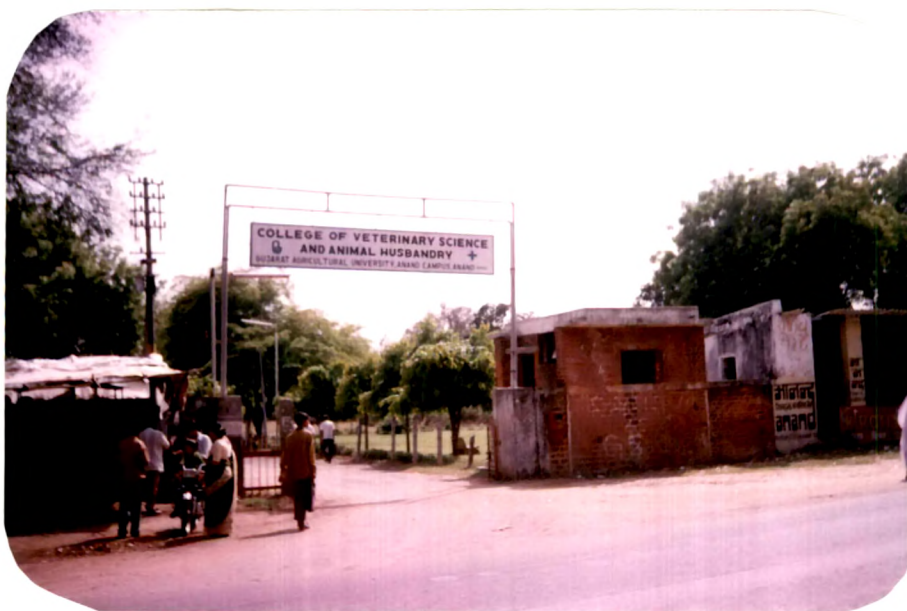
Plate 4. College of Veterinary Science and Animal Husbandry Opp. NDDB; Anand-Sojitra road.