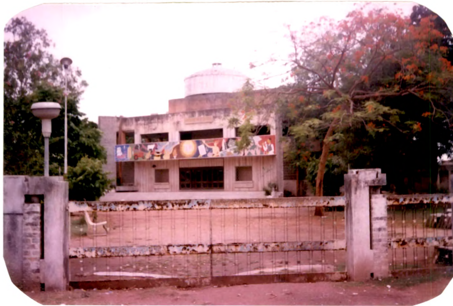
Plate 21. Town hall – Vallabh Vidyanagar road.