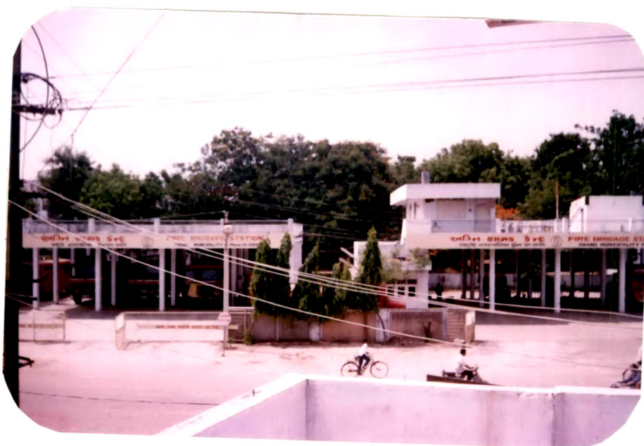
Plate 18. Fire station – Anand municipality.