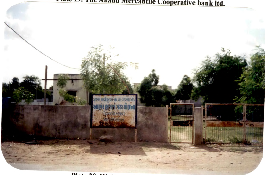
Plate 20. Water works – pumping station.