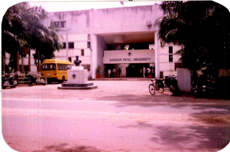
Plate 24. Sardar Patel University, Vallabh Vidyanagar.