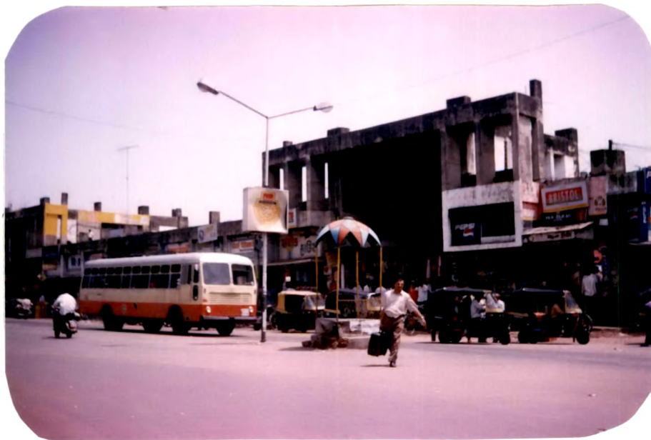
Plate 10. Municipal Super market Opposite Railway Station.