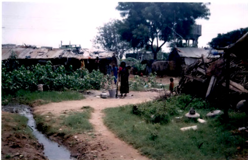
Plate B. View of Slum – Illegal water connection and open drainage.