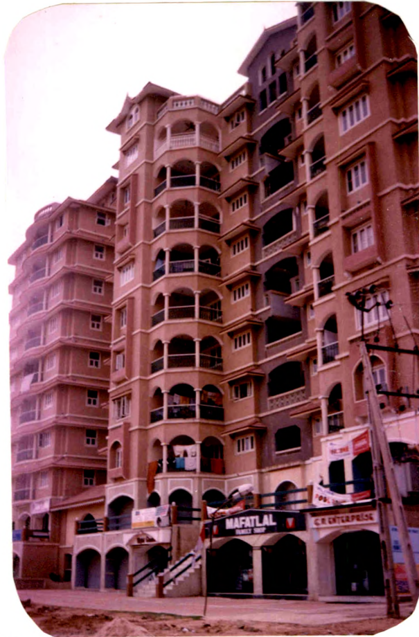
Plate 23. Multistoried buildings – Near Town hall.