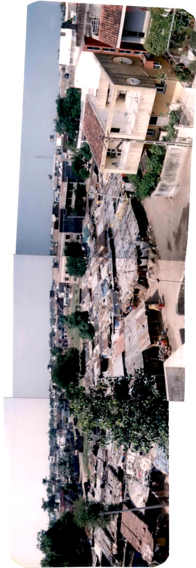
Plate E. Good housing colony interspersed with slum.