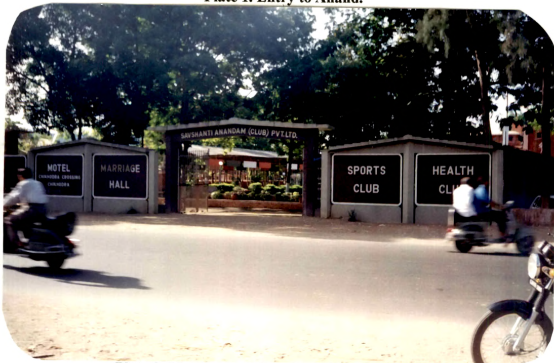
Plate 2. Motel – cum club on road towards Anand.