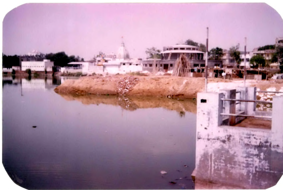
Plate 16. Landfill and reclamation of Vada tank near core.