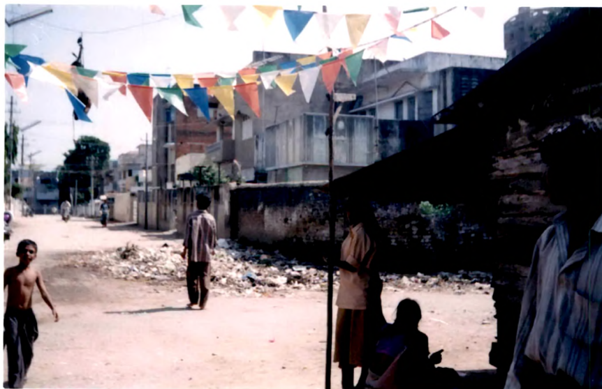
Plate D. Garbage from Slum disposed near housing society.