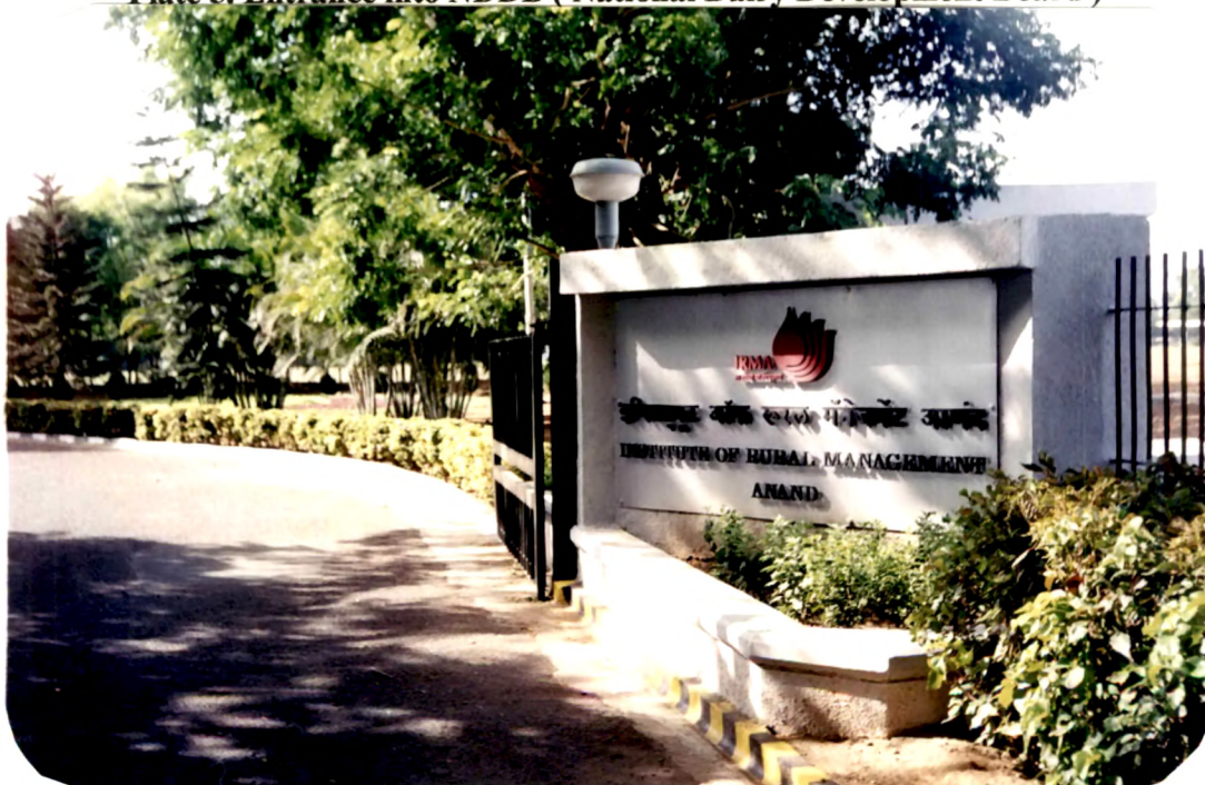
Plate 6. Institute of Rural Management (IRMA)