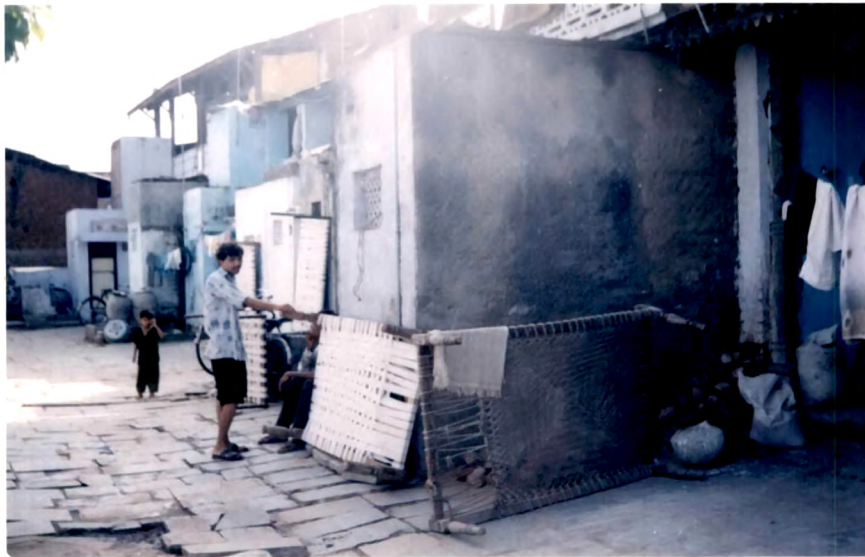
Plate F . Balpura – slum, concrete walls and tin roofs.