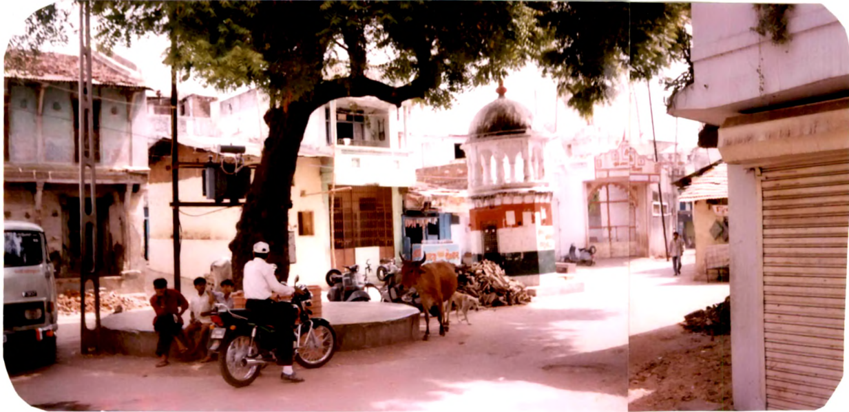
Plate 15. City core.