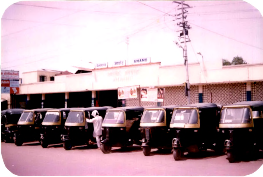
Plate 11. Auto rickshaw parking at the Railway Station, Anand.