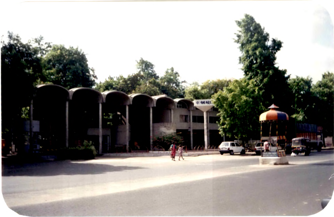
Plate 9. Amul dairy, Anand.