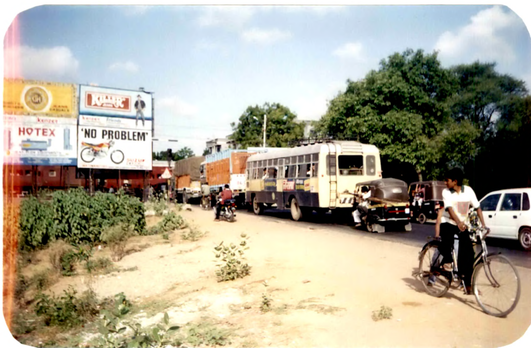
Plate 3. Traffic block at railway crossing.