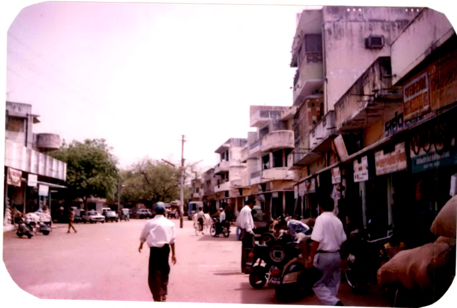
Plate 17. Sardarganj – grain market near core.