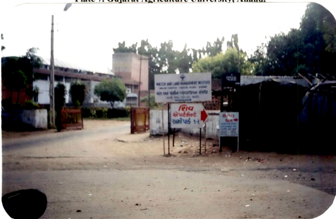
Plate 8. Water and Land Management Institute (WALMI)