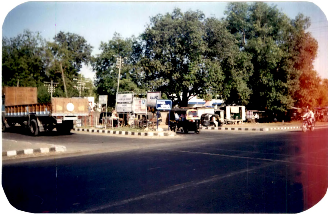
Plate 1. Entry to Anand.