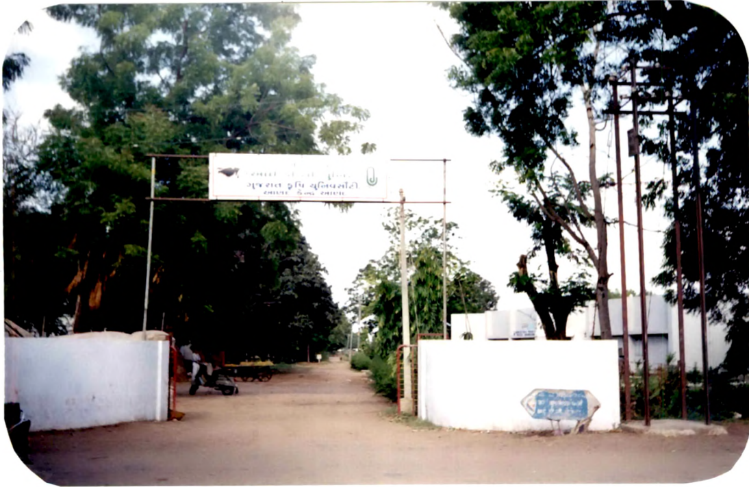
Plate 7. Gujarat Agriculture University, Anand.