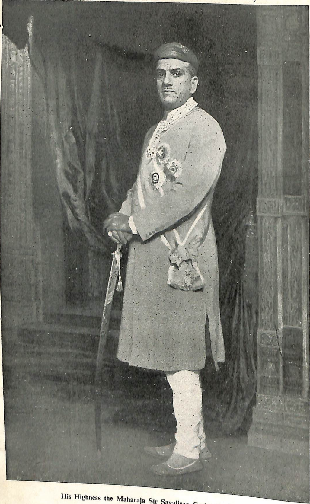
His Highness the Maharaja Sir Sayajirao Gaekwad of Baroda