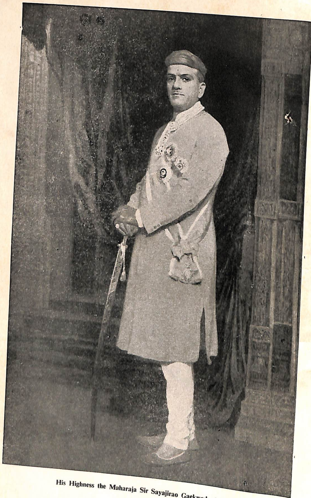
His Highness the Maharaja Sir Sayajirao Gaekwad of Baroda