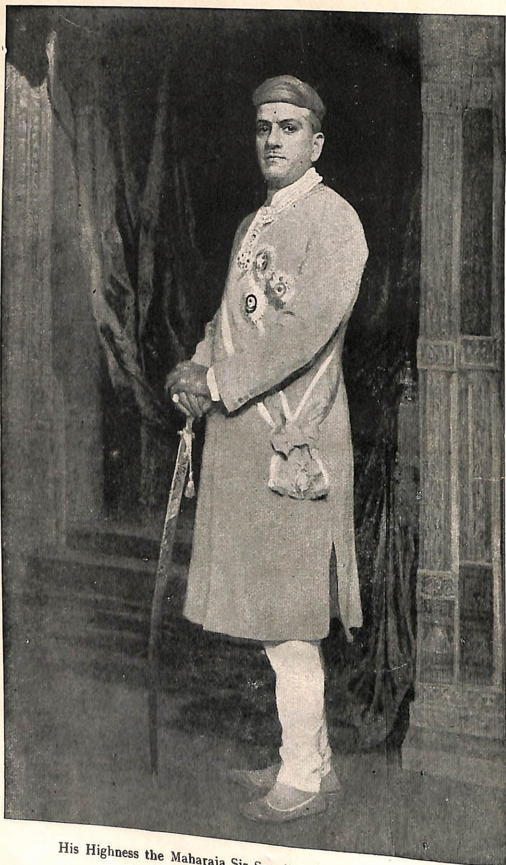
His Highness the Maharaja Sir Sayajirao Gaekwad of Baroda