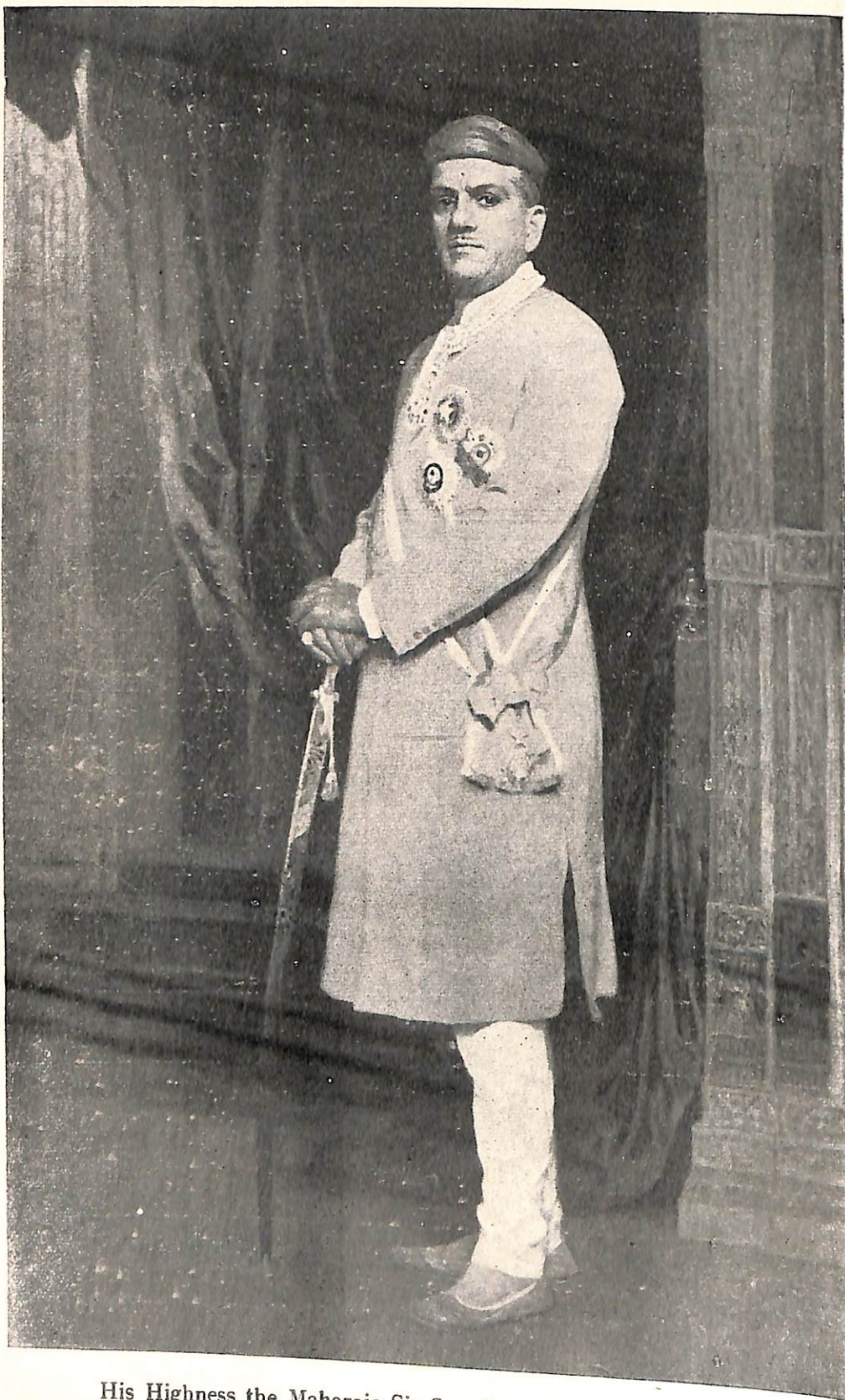
His Highness the Maharaja Sir Sayajirao Gaekwad of Baroda